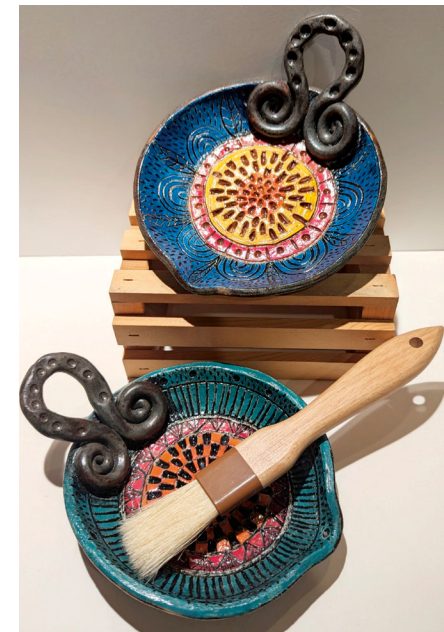
These artful garlic or ginger graters, by Carmen Caswell, are exquisitely designed, crafted, and festive for your kitchen.

In the kitchen, food-safe vessels of “functional art” add character and interest to your preparations, table settings, and useful countertop accoutrements. Woven table