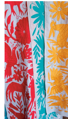
Handmade by the extended Familia de Bautista in Oaxaca, beautiful handwoven table and bed dressings.

runners, placemats, and centerpieces bring unique personality to your daily dining and parties for sure!