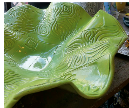
Magnificent lotus bowls, by Penne Roberts, are sensational centerpieces and beautiful salad bowls and even a bird bath in the garden (not freeze-proof).