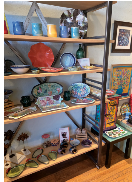
Functional art is fun! Many talented potters create fabulous and fun serving pieces, vases, and mugs!