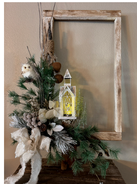
Amy Garcia designs magnificent holiday décor and creates other floral arrangements for all occasions.