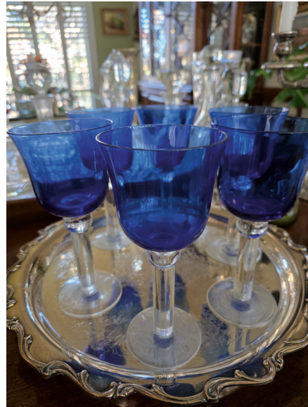
Cool colors, crystal silver, and winter whites are a refreshing palette for renewing the spaces around you.

Winter is a cozy time. What began as fall set-in, with the warm colors of autumn, the winter of the new year suggests icy, cool, refreshing elements – balanced (there's that word again) with soft, warm textures. By purging the fall and early winter seasonal themes, we can introduce some fresh colors – cool blues that punctuate your cozy interiors. Retire that pumpkin-colored throw on the sofa with a refreshing winter white, silver-blue or soothing turquoise. The cool color will be