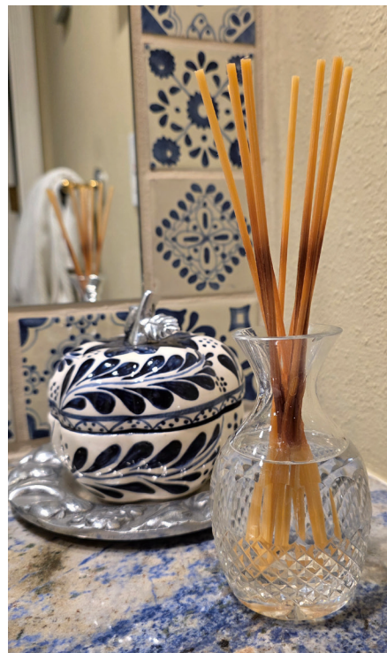
Changing the vessel for your diffusers makes them more personal and customizes the look. Citrus is nice after the spicy scents of the holidays.

complimented by the snuggly texture, making a new look and feel to your interior as you enjoy the remaining weeks of winter.