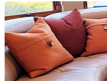
Throw pillows are fun to change seasonally. Spice it up!

Go forth, simmer a pot of cinnamon sticks and embrace this cozy new season!