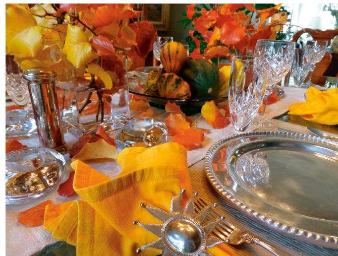
Autumn gourds with fall leaves, pewter, silver, crystal and colorful cotton napkins.

Gatherings of family and friends are also the perfect time to invite “old friends” to your table with a mix of the new. Funny how the influencers of home décor will create and market inventory of nostalgic dinnerware (even disposable) with “pricey” tags when so many family china collections, crystal, silver and other fabulous accessories are forgotten. Open the boxes, remember the traditions, imagine the gatherings that took place over past generations with these fragile, exquisitely