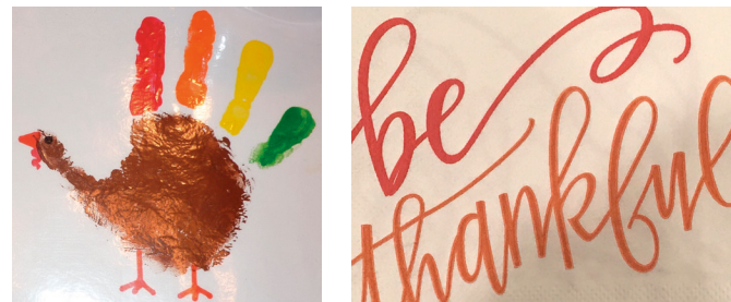
Bring kids into the activities making place cards and other decorations.

seasonal change it is fun to pull from nature and discover decorative opportunities in the real changes taking place outside. As the seasons shift, apples and gourds are locally available. You might find colorfully flavorful persimmons, from other parts of the country or beyond, in crates in the produce departments. From the traditional cornucopia, using seasonal fruits and vegetables makes wonderful centerpieces for your holiday table dressings.