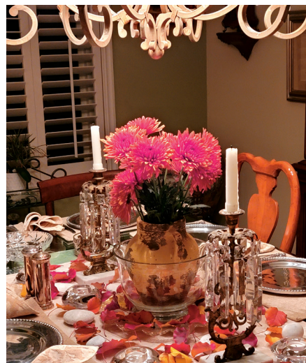
Invite old friends! Mix vintage with contemporary.