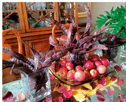
Apples and Honey Locust pods with scattered Bradford Pear leaves create a seasonal centerpiece.

From a practical standpoint, it is helpful to try to visualize the design of your space in the other seasons. If you are designing and implementing in summer, with lightweight textures and cooler colors, imagine that same scene in the depths of winter when the temperature drops and being inside provides warmth and a reprieve from the cold. You might experience this in a mountain cabin or ski lodge where warm colors and rugged textures of stone and wood are preferable to